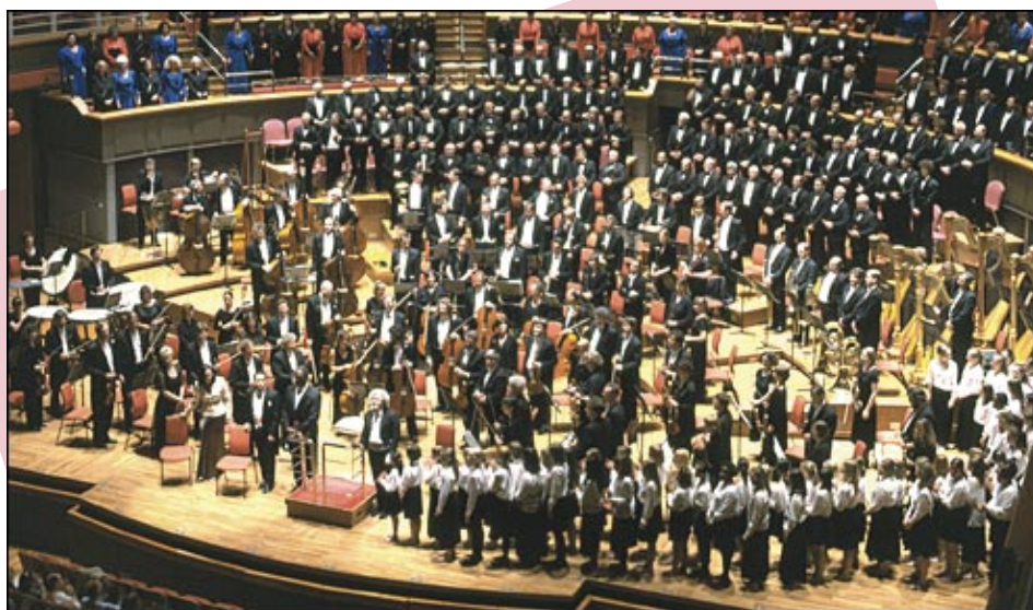
Sir Simon Rattle conducts The Damnation of Faust in Birmingham

London New York San Francisco Seattle Canberra Berlin Paris Venice Prague Moscow St Petersburg