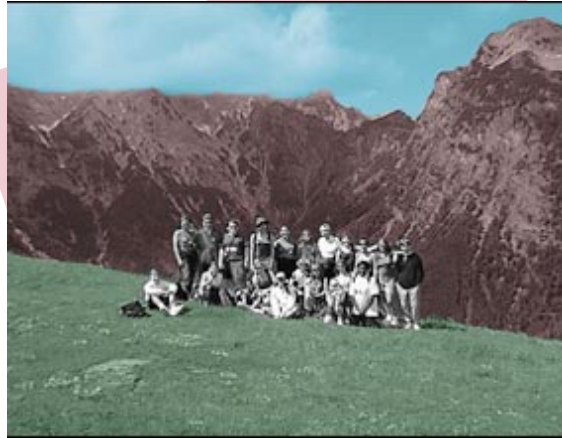
'The hills are alive...'

The great highlight of the trip was in Germany's Erfurt and Eisenach, two important towns in the history of JS Bach. This July, Erfurt hosted an international festival for the 500th anniversary of its town bell, 'The Gloriosa', the largest free-swinging bell in the world. The Alaska Children's Choir performed as an hon-