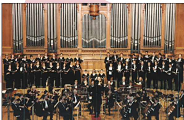
Duquesne choir in the Moscow conservatory