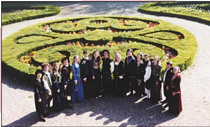
Palo Alto (CA) High School Madrigal Singers in Albi, France