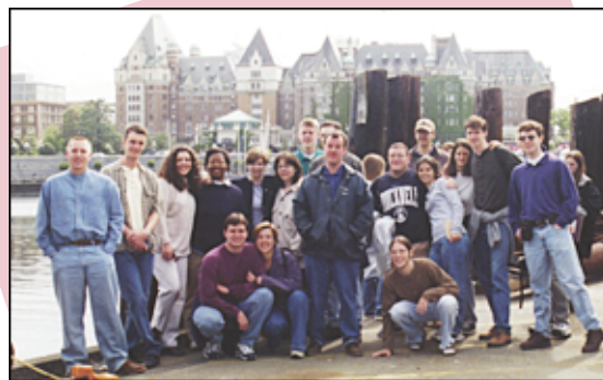
Bucknell choir in Victoria, BC

without crossing an ocean, and perform its music in a cutting edge arts environment.