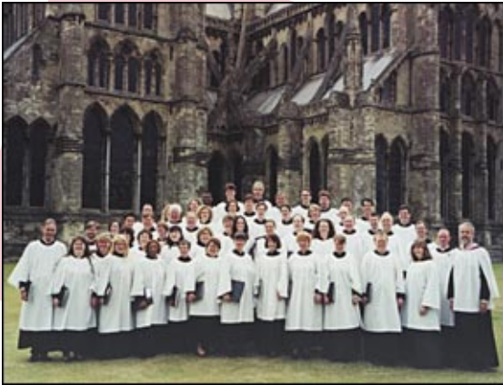
Outside Salisbury Cathedral

One of the bastions of the Anglican tradition, Trinity Church in the City of