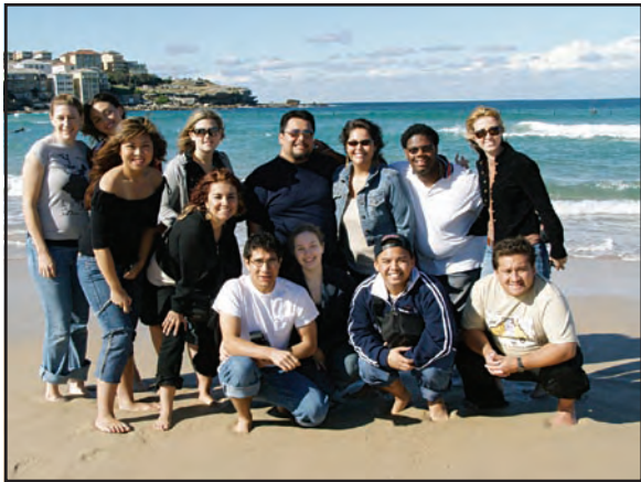
Members of the CSU Fullerton Chamber Singers at Manly Beach in Sydney

All the concerts were given in collaboration with local choirs, providing the Californians an opportunity to meet Australians with a similar interest in music