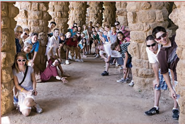
Colorado Children's Chorale enjoys some free time at Parque Güell, Barcelona

The Colorado Children's Chorale toured Spain and France, stopping in Barcelona, Montelimar and Saint Maximin. The group performed concerts in Barcelona, Pals and Montelimar, an informal recital in Montserrat and participated in the 11ième Festival Choral International En Provence.