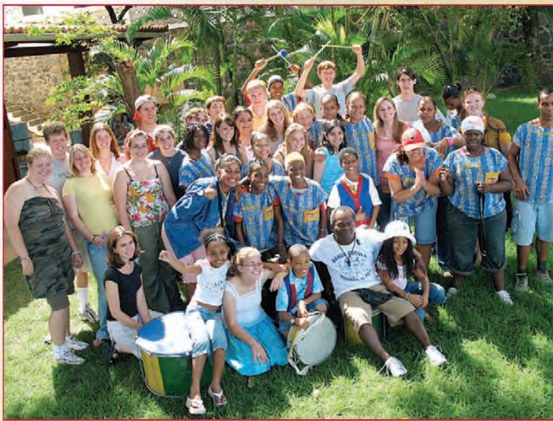
Palo Alto High School Choir during a workshop with a Bahian Afro-Brazilian percussion group in Salvador da Bahia, Brazil

Brazil was a whole new experience for the Palo Alto choir members who began their tour in the northern city of Salvador da Bahia that is rarely visited by touring choirs. At the height of World Cup fever, the choir performed to an almost full house in Rio de Janeiro, enjoyed an excellent joint concert in Petropolis Cathedral and sang to a standing-room only audience in the beautiful coastal town of Paraty.