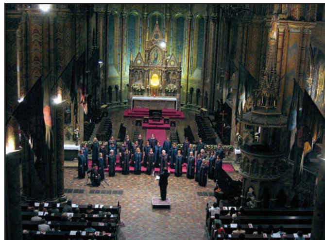
Peninsula Women's Chorus performing in St. Matthias Church, Budapest