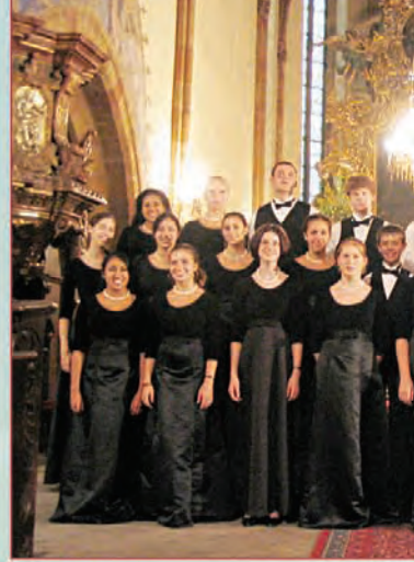
The Head-Royce School concert in of the B M Cernohorsky Festival of Republic

The Portland Symphonic Girlchoir performed in Notre Dame Cathedral in Paris. The group, which was performing an informal recital, had over 200 people sit down to enjoy their performance in the famous cathedral. The choir toured through Paris and York, where they participated in the Choral Music Experience festival.