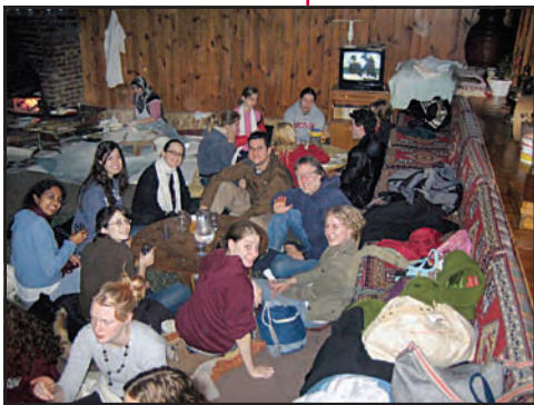
Vassar members enjoying a traditional meal at a rural Turkish village