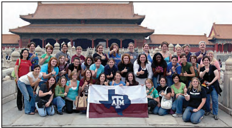
Texas A&M Women's Chorus at the Forbidden City in Beijing

I have to admit, my knowledge of China was extremely limited going into this trip. So, it was quite enlightening to visit the great monuments you only ever hear about: the Forbidden City, the Great Wall, the Jade Temple, the Terra Cotta