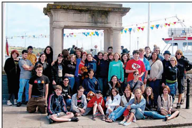
Nevada Union High School Band in Plymouth

the tour. I stayed with an amazing family in Penzance, who not only opened up their home, but also their hearts, to me and two of my fellow band members. We barbecued on the beach and swam on the shores of Penzance at sunset. We experienced English hospitality by drinking tea with three Cornish gentlemen in the midst of parade floats and decorations. We performed to thousands on the packed streets of Penzance, with the breeze blowing my gold and blue color guard flag and a smile on my face as I heard comments from the crowd of, "There go the Americans", and while spinning my wooden rifle the exclamations of, "They've got shooters!" We marched through the colorful streets filled with bright banners and floats in the Golowan festival. We listened to music in the park by our hosts, the Penzance Youth Wind Band.