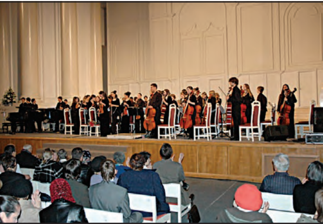
Denver School of the Arts Orchestra in Smolny Cathedral, St. Petersburg

Last spring break, I participated in an ACFEA-led tour of Russia with the Denver School of the Arts Orchestra. During this trip, we visited the capital city of Moscow, the small town of Novgorod, and the historic city of St. Petersburg. We