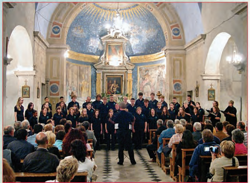
Central Dauphin and Hershey High School Choir in concert in the Chiesa S. Biaggio, Sant' Oreste, Italy.

Central Dauphin and Hershey High School Choir enjoyed a wonderful 10-day tour of Italy, which included stops in Rome, Montecatini Terme, Vicenza and Venice. A highlight of the tour was a joint concert in Marostica with Gioventu in Cantata in the Chiesa S. Antonio.