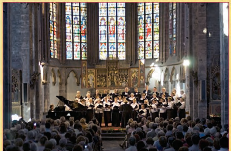
Chorus North Shore singing in the Eglise St. Jacques in Tournai, Belgium