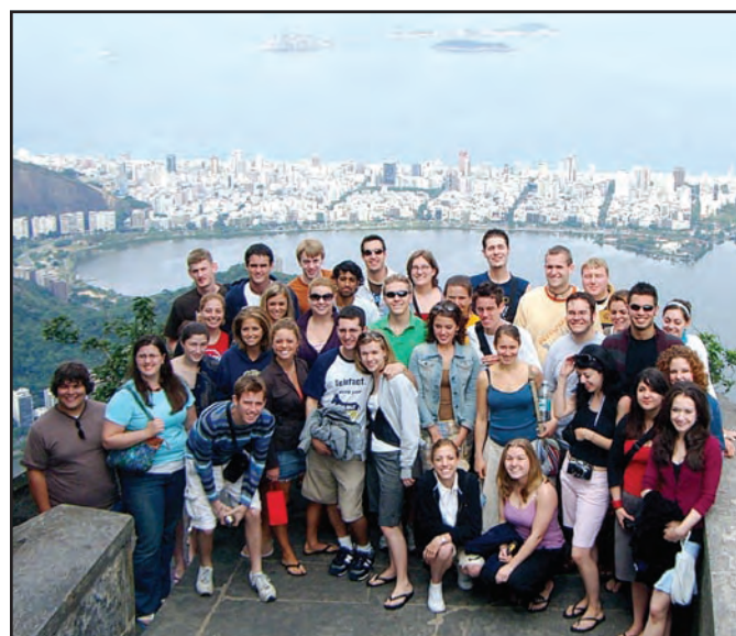
Heinz Chapel Choir at Corcovado in Rio de Janeiro