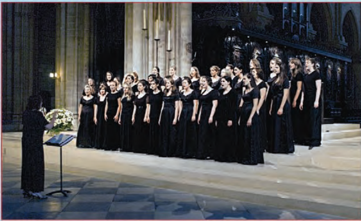
Portland Symphonic Girlchoir in Notre Dame Cathedral, Paris