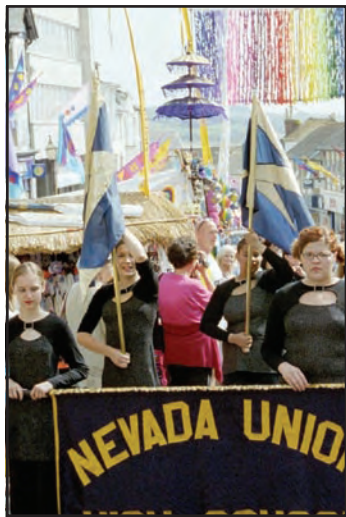
NUHS in the Mazey Day Parade in Penzance

As cheesy as it may sound, it was the trip of a lifetime! How many high school students get the chance to travel to England with sixty of their closest friends, march down the streets of Cornwall while leading a procession for the mayor, make friends from around the world, see the artistry of Stonehenge and discover the ancient beauty of England?