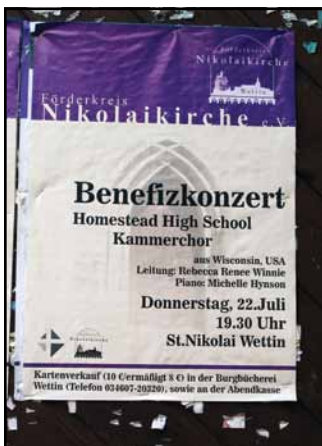
Posters were up around town promoting the concert.