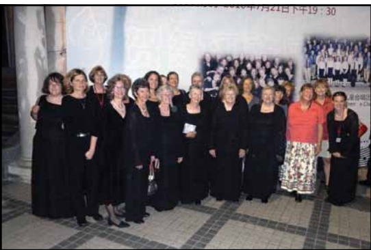
Bella Voce at the Shanghai Conservatory Concert Hall in China

Bella Voce's trip to China was a thrill, better than any of us ever could have dreamed! The highlight of the trip was ...well, there wasn't just one. The most memorable concert was certainly in