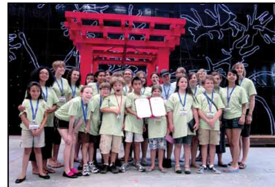
Sierra Nevada Children's Choir at the World Choir Games in Shaoxing, China

It's difficult to know where to begin in writing about a trip filled with superlatives! The Sierra Nevada Children's Choir 2010 Tour of China and the World Choir Games far exceeded our expectations and provided us with