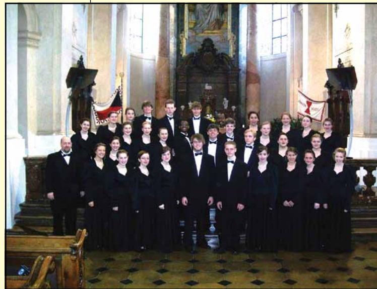
The Davidson Chorale in St. Nicholas Church, Old Town Square in Prague, Czech Republic