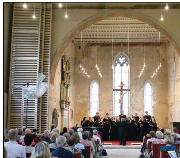
Kammerchor performed a benefit concert for the Nikolaikirche in the tiny city of Wettin. The church was a ruin, and is undergoing restoration.

ceiling with too many ancient volumes to read in a lifetime. They entered the cathedral respectfully and took their place among the other tourists, snapping pictures and murmuring quietly about the incredible beauty around them. Then suddenly they merged and formed a choir, stepping quietly forward as one voice rang out in song. As the others blended their voices in, there was a gradual yet increasingly powerful aura that enveloped everyone in the cathedral. The music grew full and lush and filled the cathedral, drawing out the echoes of voices raised in praise for more than a thousand years. The crescendos of the music dived deeply into the core of every soul in the church, and many, many wept. And then just as suddenly it was over, and the singers silently dispersed, becoming invisible once more among the stunned tourists in the cathedral. The voice of divinity – the music – had touched every soul in a way that changed them forever. Kammerchor joined the history of the place, and of music itself, in an indelible way. The music that they made there echoed its way out behind us as we moved on – and yet a part of us will linger in that moment, in that holy place, forever.