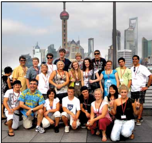
McQueen High School Jazz Choir in Shanghai, China