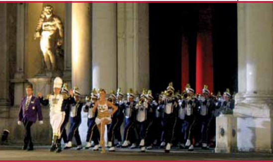
The Husky Marching Band performs at the Ducal Palace as part of the Modena Tattoo in Italy

such an undertaking will be genuinely appreciated by the literally thousands of people who attend the tattoos. Our members left the tour having been treated like rock stars and that, along with the opportunity to share performances with incredible musicians from around the world, will undoubtedly have me looking seriously at other similar events for our next tour. 📍