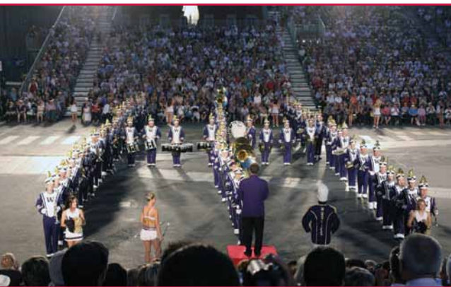
Performing in Piazza Roma in Modena

pitch on our potential participation in a military tattoo that absolutely sold me on the idea.