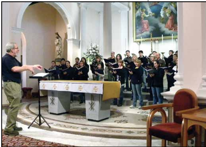
Fresno Pacific University Concert Choir rehearses in Sacred Heart Cathedral in Wellington, New Zealand for its joint concert with the Seraphim Choir of Chilton Saint James School