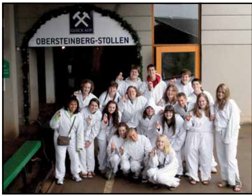
Kammerchor emerges from the Salt Mine near Salzburg, equipped with mini salt shakers and slide stories.