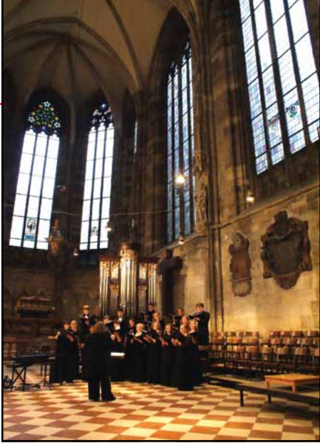
The choir performed in the Stephansdom (St. Stephen's Cathedral) in central Vienna. They drew their biggest crowd there, as people heard the music and wandered into the church. It was a gorgeous setting on a beautiful summer evening.