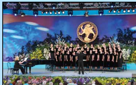
Columbia Choirs perform at the Llangollen International Eisteddfod in Wales

Northern Arizona University's Shrine of the Ages Choir and the Master Chorale of Flagstaff at the Cape of Good Hope, South Africa