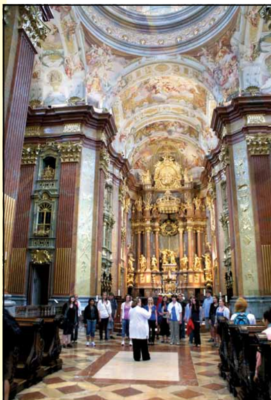
Kammerchor performs at the Thomaskirche in Leipzig. The choir is standing in front of the tombstone of J.S. Bach.

They were just another group of young tourists among many others that morning at the Abbey in Melk – the place itself called an offering – Stift Melk. The cathedral was at the end of an abbey tour that had gleamed with ancient treasures including a splinter from the cross where Jesus was crucified, and a library lined floor to breathtakingly-muralled