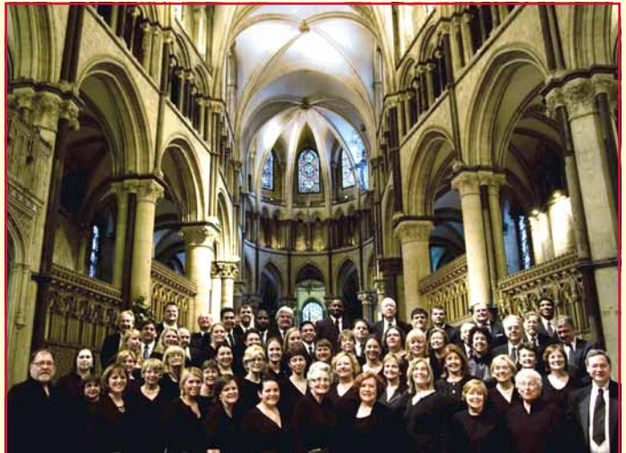
St. Martin's Episcopal Church Choir in Canterbury Cathedral