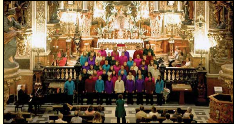
Anima performs in the Basilica de Nuestra Señora de las Augustias in Granada, Spain

There were so many little things about the tour that I really enjoyed, such as singing in the ornate Spanish