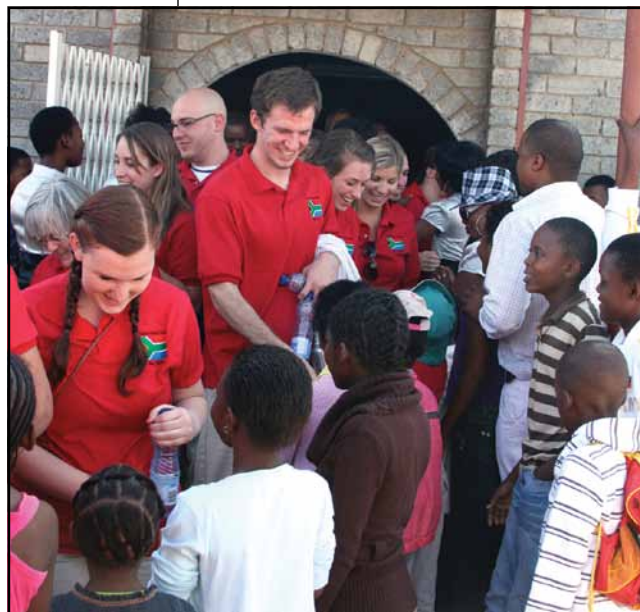
NAU students greet locals after a service participation at Philadelphia Ministries near Sun City, South Africa

venue in Endler Hall was stunning: a beautiful space all in wood with a tracker organ on stage. This was to be an informal exchange with the choir since it was their finals week,