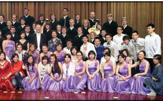
Greystone Singers with XJTU choir and orchestra in the XJTU auditorium in Xi'an, China

It was quickly apparent that even though we were from cultures half a world apart, we formed a bond with each other through music; and