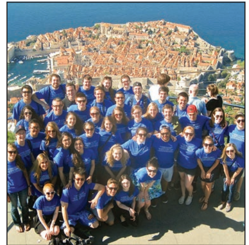
Heinz Chapel Choir on top of Srd Hill in Dubrovnik, Croatia