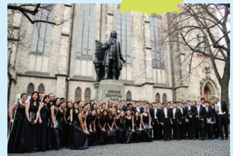
Princeton University Glee Club at the Bach statue outside of the Thomaskirche in Leipzig, Germany

each moment as it came by. The fairytale, ice-crusted landscape on our drive from Nuremberg to Prague, the mulled wine that warmed my insides and made me think of Butterbeer in Harry Potter, the lit faces that greeted us at every concert, singing the Bach Magnificat in the Thomaskirche, filling restaurants to the brim, celebrating birthdays and making music together are all highlights that bring a smile to my face. I can still feel the tour afterglow in our rehearsals now, and I cannot wait to see where this adventure will lead us next. I am grateful for everyone and everything that made this tour possible – it sure was a good one.