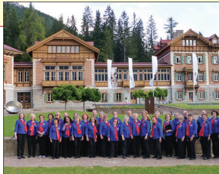
Sno-King Community Chorale at Gustav Mahler Hall in Dobbiaco, Italy as part of the Alta Pusteria International Choir Festival