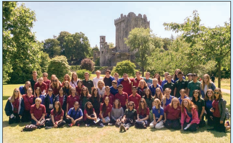
Southern California Children's Chorus at Bunnratty Castle

Touring unites our chorus, teaches responsibility, punctuality and requires kids to become more mature. Touring opens our minds to different cultures, different foods and different people. Touring tests young people to get along with others for a confined and lengthy period, a great lesson for all of humanity. 📺