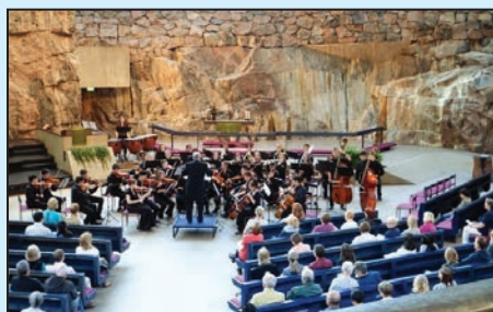
Cascade Youth Symphony Orchestra performs in the Church of the Rock in Helsinki, Finland