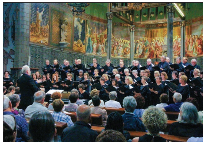
Plano Civic Chorus performs in the Església Santa Maria in Blanes, Spain