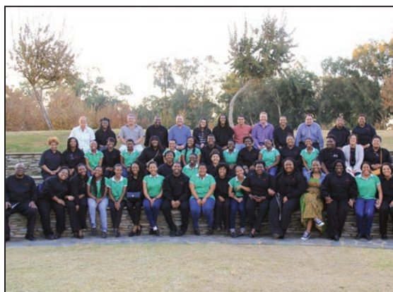
Winston-Salem State University Choir with Oprah Winfrey Leadership Academy students in Henley-on-Klip, South Africa

"The WSSU visit to the Oprah Winfrey Leadership Academy was truly a highlight of the tour. The girls at the Academy are unbelievably passionate, energetic and brilliant, and they were one of the best audiences I've ever encountered. Their reactions to the choir's singing were so real and vibrant that the energy in the room could hardly be contained.