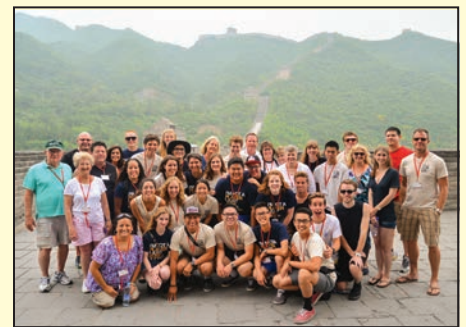
Fountain Valley High School Troubadours at the Great Wall of China

For my singers, one of their highlights was unequivocally a music exchange we did with a local high school choir in Hong Kong. After getting to perform a finale piece together, the students shared some time talking and taking photos. I know many of them have maintained friendships over thousands of miles – all brought together by the joy and love of making music. These are certainly experiences that cannot be intentionally planned but, thanks to ACFEA, all of the puzzle pieces were in place for this and so many other memorable, life-changing experiences to occur!