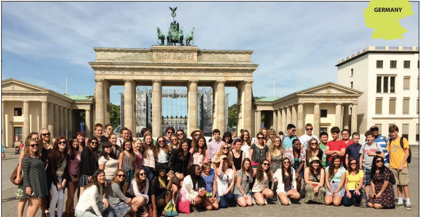
Rocky Mountain Children's Choir at the Brandenburg Gate in Berlin

The Rocky Mountain Children's Choir (RMCC), based in the Denver area, comprises both mixed and single-sex ensembles of varying ages. As its mission states, RMCC "actively seeks children from diverse backgrounds and offers the opportunity to experience musical excellence in a multicultural environment." The group has just returned from its third tour with ACFEA. RMCC travelled twice with us in 2012, to Washington, D.C. with Summit, one of its eight performing ensembles, and to Quebec with Mountain Aires, Fourteeners, Altitude, and Thin Air, four of its advanced ensembles.