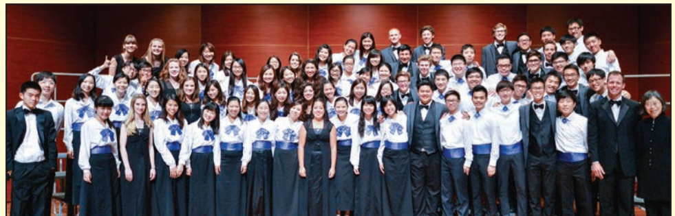
Fountain Valley High School Troubadours with The Music Office Youth Choir in the Academic Community Hall at Hong Kong Baptist University