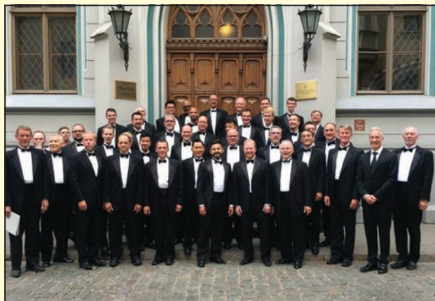
Golden Gate Men's Chorus at the Great Guild Hall in Riga, Latvia

How gratifying that this first international tour may lead to more in the future – a nice endorsement of our goal to create opportunities for memorable and life-changing experiences. 📌