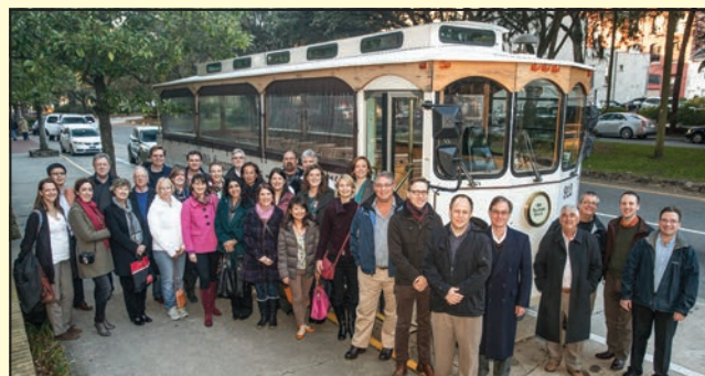
ACFEA staff in Savannah, GA during our 2014 Global Summit

most venerated holy places in all of Christendom. Performing a fully unaccompanied program there permitted us to explore the acoustical glories of the space, and the large audience made clear its pleasure at what they had heard.