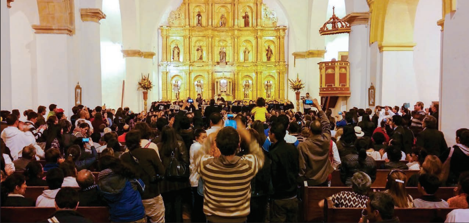
DC Youth Orchestra Program performs in the cathedral in Villa de Leyva, Colombia