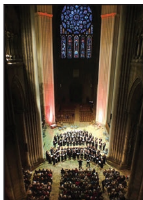
Hartford Chorale performs in Chartres Cathedral